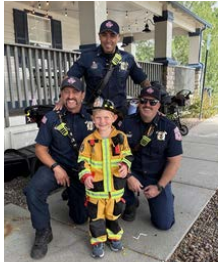
REUNION COFFEE HOUSE STORYTIME