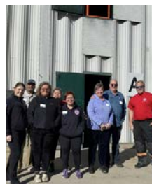
CITIZEN FIRE ACADEMY