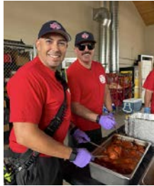
63 RD ANNUAL SPAGHETTI DINNER