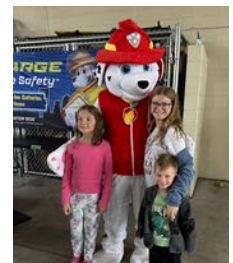
COMMUNITY FIRE SAFETY