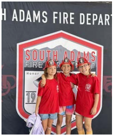
JR. FIRE ACADEMY